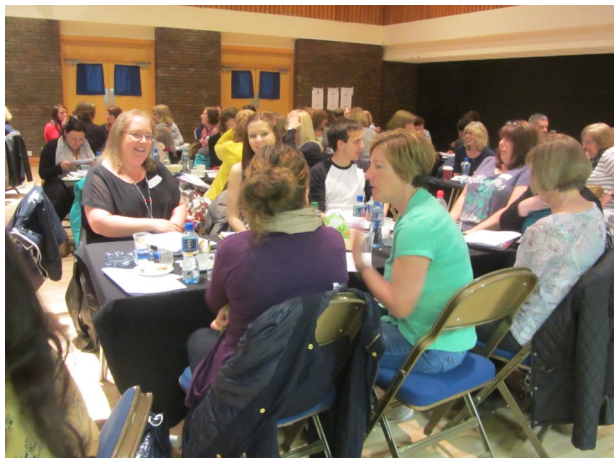
Photo: 80 staff from 20 schools attending 'No Two Children are the Same' training with Fintan O'Regan.

The Meeds SEND Alliance is supporting schools in Burgess Hill and Hassocks through outreach, training, advice, resources and parent carer support.